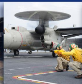
US Navy Airfield

Scope: Operations Support | Goliad TX Amount: $3,999,225.00